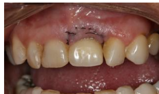
Fig. 2: 10 days post-op. (El. 21)

In 10 days post-op a satisfactory soft tissue coronal migration was observed, with papilla formation (Fig. 2)