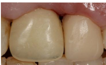
Fig. 7: Widening of the interdental spaces, intrasulcular incision and hyaluronic acid application. (Els 21 e 22)

After reaching this objective the option was taken to widen the space between the teeth by wearing down the temporary crown. An intrasulcular incision was performed under local anesthesia to promote the inflammatory process followed by an immediate application of 0.1 ml of hyaluronic acid and thus promoting the increase in papilla height (Fig. 7).