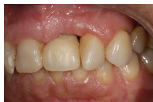
Fig. 3: 60 days into post-op

Sixty days into post-op a margin and papillae apical recession was perceived between the central and lateral left maxilar incisors, forming a “black triangle” (Fig. 3).