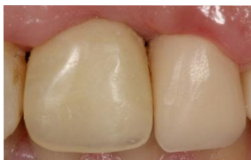
Fig. 6: Papilla after two other applications within a 30 day interval after temporary tooth installation (Els. 21 e 22)

After reaching this objective the option was taken to widen the space between the teeth by wearing down the temporary crown. An intrasulcular incision was performed under local anesthesia to promote the inflammatory process followed by an immediate application of 0.1 ml of hyaluronic acid and thus promoting the increase in papilla height (Fig. 7).