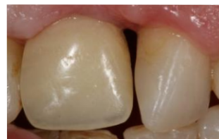
Fig. 4: Result observed after 4 applications of hyaluronic acid. (Els. 21 e 22)

The patient was informed that this was a new treatment option, and signed a treatment consent form and image rights consent form. The application methodology was based on the work of Becker et al 2010, 29 in which it was reported that the acid must be done 2-3 mm from the gingival margin. The injection was given 4 times in a 3-month period with a 0.06-0.1ml hyaluronic acid dose for each of the applications (Fig. 4).