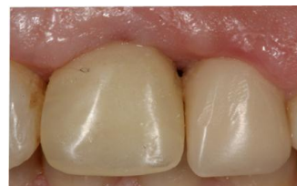
Fig. 8: Reevaluation 17 days after procedure and new hyaluronic acid application. (Els. 21 e 22)

An increase in papilla growth of 1.0 mm (Fig. 8A and B) was analyzed and measured through computerized comparisons.