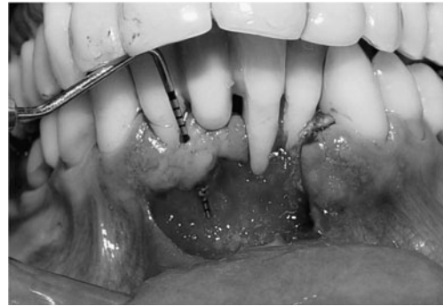
Fig. 2 Partial thickness dissection

central incisor) and Miller class II recession on Tooth #42 (the lower right lateral incisor) were also observed (Fig. 1). A probing depth of 1 mm was found for Tooth #31 with bleeding on probing, 7 mm gingival recession and an 8 mm clinical attachment level. A probing depth of 1 mm was found for Tooth #42, with bleeding on probing, 5 mm gingival recession and a 5 mm clinical attachment level. The possible etiology was considered to be incorrect tooth-brushing technique in combination with abnormal frenum attachment.