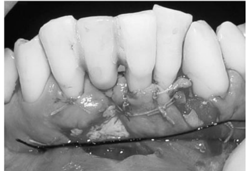
Fig. 4 Graft and lateral flap sutured