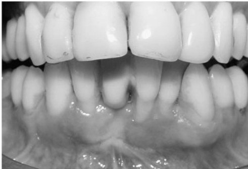
Fig. 5 Periodontal and esthetic conditions at 3-month postoperative follow-up