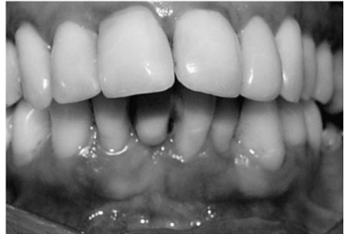
Fig. 6 Partial root coverage and favorable esthetic results observed at 12-month postoperative follow-up