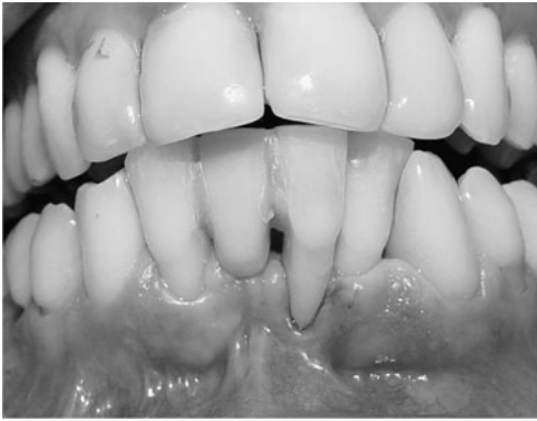
Fig. 1 At baseline, clinical examination revealed Miller class III recession and lack of attached tissue on Tooth #31 (lower left central incisor) and Miller class II recession on Tooth #42 (lower right lateral incisor)