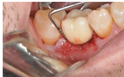
Figure 2 - Clinical image of the peri-implantitis probing measuring 10 mm

The treatment plan comprised surgical intervention with curettage and mechanical decontamination with bicarbonate jet, chemical decontamination with tetracycline, and particulate bone graft.