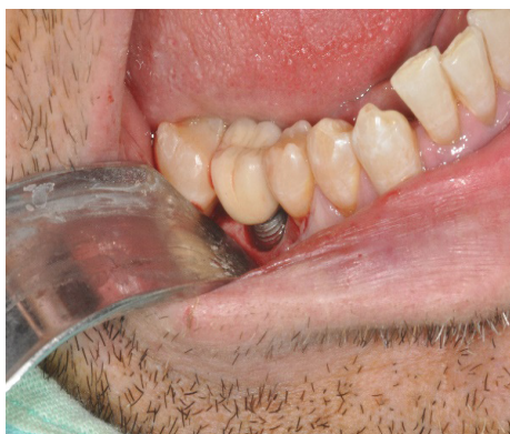
Figure 6 - Post-treatment clinical image, removal of the granulation tissue, bicarbonate jet, and tetracycline conditioning

Curettage of the granulation tissue was performed with Gracey curette #7/8, associated with the bicarbonate jet and use of tetracycline. A capsule of 500 mg was dissolved in 5 ml of serum, and the suspended solution was rubbed in the surface of the implant following irrigation with saline solution (figure 6).