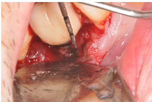
Figure 5 - Clinical image of the peri-implantitis and probing after flap raising.

Curettage of the granulation tissue was performed with Gracey curette #7/8, associated with the bicarbonate jet and use of tetracycline. A capsule of 500 mg was dissolved in 5 ml of serum, and the suspended solution was rubbed in the surface of the implant following irrigation with saline solution (figure 6).