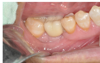
Figure 3 - Initial clinical image of implant at the area of tooth #46 with cemented crown

Previously to the beginning of the surgery, mouth antiseptics was performed with 0.12% chlorhexidine digluconate. The regional block of the inferior alveolar nerve was performed with Articaine solution 4% with 1:100.000 adrenalin (Articaine® - DFL Industry and Commerce Ltda., Rio De Janeiro, Brazil). After that, with the aid of scalpel blade #15, an intrasulcular incision was executed on teeth #45 and #47 (figure 4). Next, the total a buccal and lingual flap was raised to access the tissue granulated that was next to the implant (figure 5).