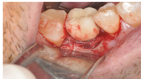
Figure 4 - Clinical image after intrasulcular incision and raising of total thickness flap. It is observed the presence of granulation tissue at the buccal surface of the dental implant

Previously to the beginning of the surgery, mouth antiseptics was performed with 0.12% chlorhexidine digluconate. The regional block of the inferior alveolar nerve was performed with Articaine solution 4% with 1:100.000 adrenalin (Articaine® - DFL Industry and Commerce Ltda., Rio De Janeiro, Brazil). After that, with the aid of scalpel blade #15, an intrasulcular incision was executed on teeth #45 and #47 (figure 4). Next, the total a buccal and lingual flap was raised to access the tissue granulated that was next to the implant (figure 5).