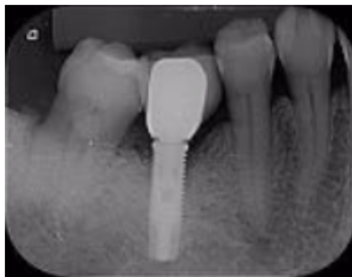
Figure 8 - Periapical radiographic image 6 months after the treatment, with reduction of the peri-implantitis bone defect

The suture was removed 10 days after the surgery. At 45 postoperative days, the patient did not present any clinical signals of peri-implantitis inflammation. At 6 postoperative months, the patient returned for following-up. The clinical examination revealed no of increased probing depth and bleed to probing. The radiographic examination revealed that the bone defect was partially filled by new bone (figure 8).